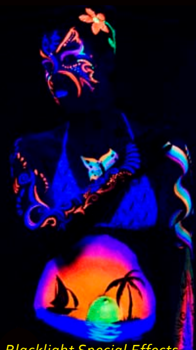
Blacklight Special Effects